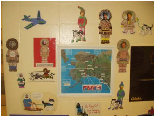
Musher nametags in Anchorage