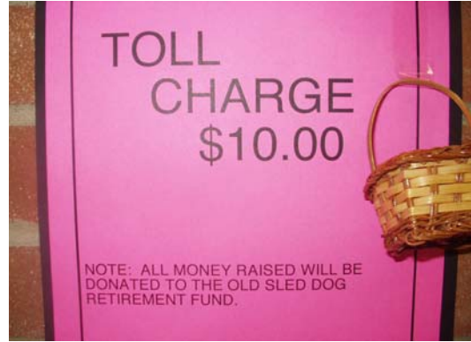
Tolls on the trail?????