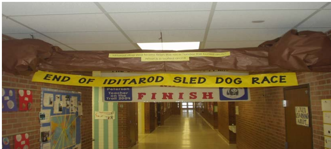
The Burlled Arch in Nome